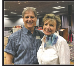
Squares By: Mike & Lisa Seastrom

Advanced: 6:00 - 7:00 *** Rounds 7:00 - 7:30 *** Squares & Rounds 7:30 - 9:30