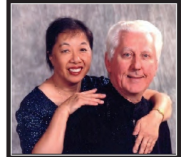
Rounds By: Zena & Ernie Beaulieu

Snacks *** 50 / 50 *** Raffle Prizes *** Fun For All Donation $12.00